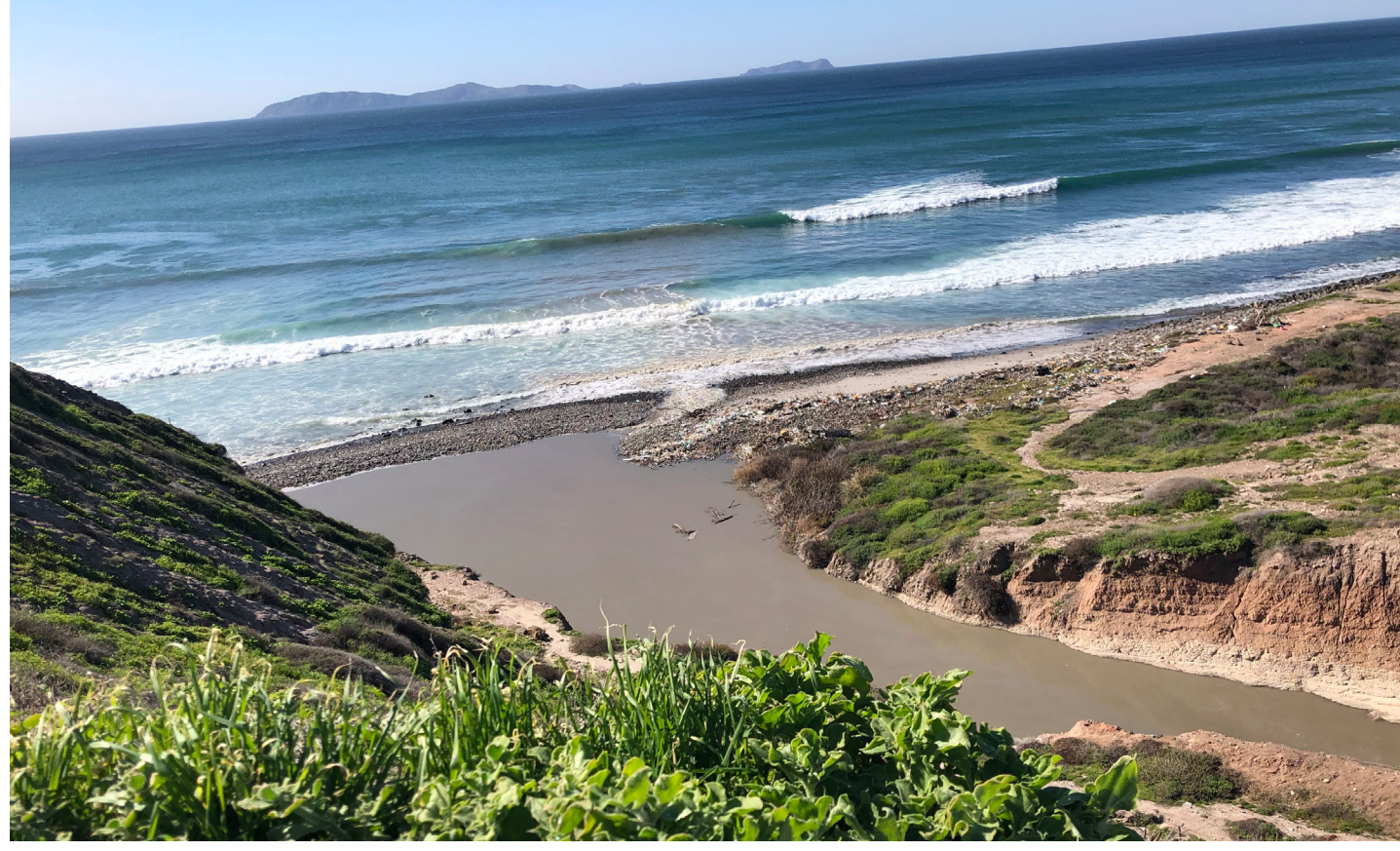
Raw sewage flows from a Tijuana canal directly into the Pacific Ocean.

Broken promises by U.S. and Mexico keep millions of gallons of raw sewage flowing into Pacific Ocean, Coronado, other beaches